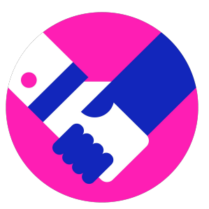
For Districts and Province